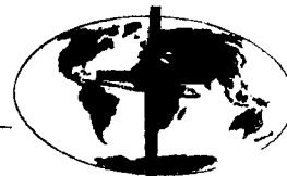
SS SIMON + JUDE