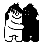
World Mission Sunday